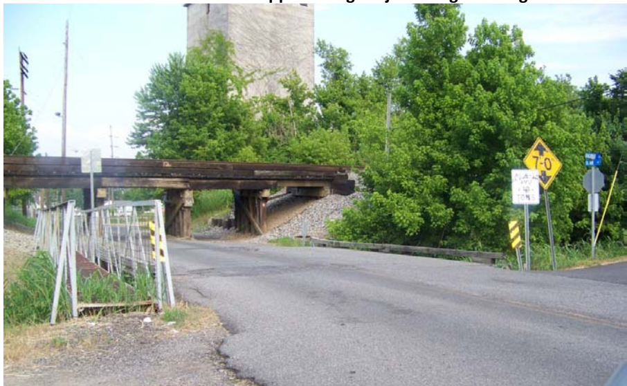
Exhibit 7: KY-1826 approaching Pedestrian Bridge connected to Project Bridge looking east