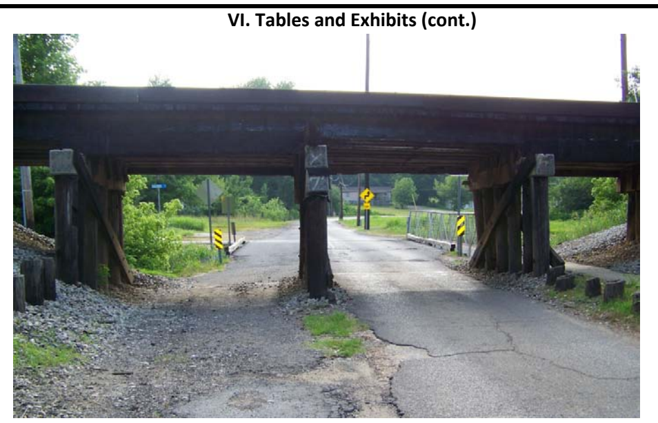
Exhibit 9: KY-1826 gazing through Railroad bridge to Project Bridge looking west