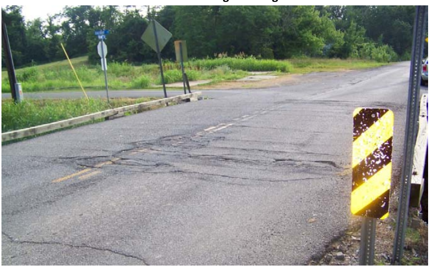
Exhibit 11: KY-1826 looking south west onto Project Bridge