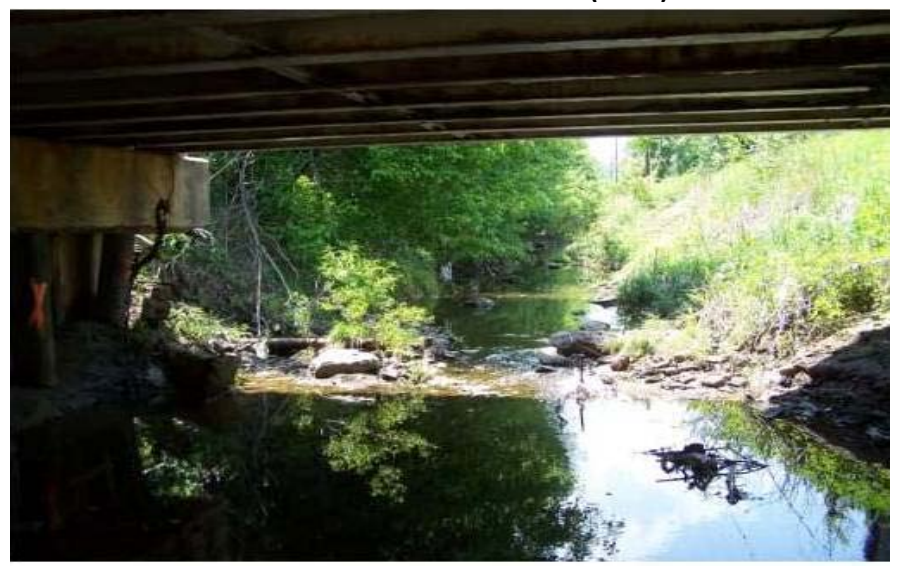
Exhibit 12: KY-1826 Project Bridge looking Upstream