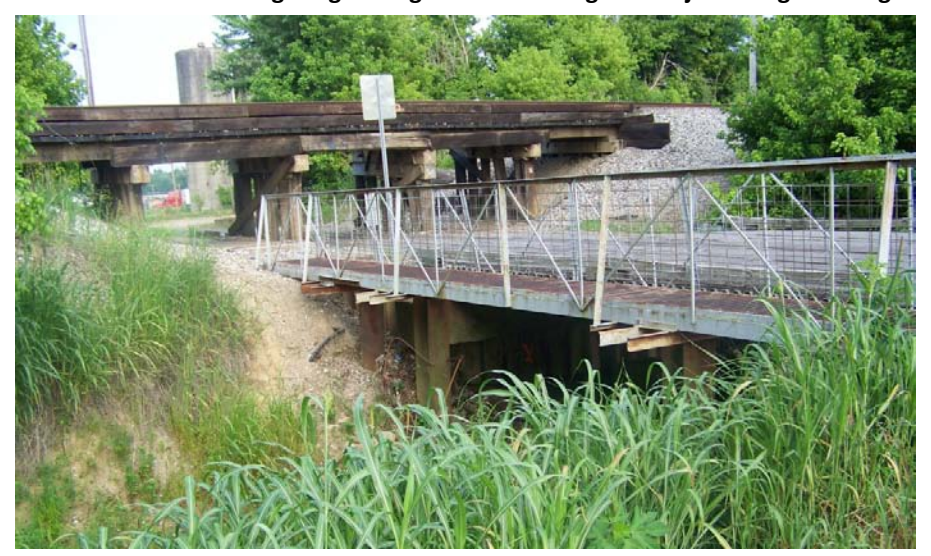
Exhibit 10: KY-1826 Pedestrian Bridge looking south west from north east