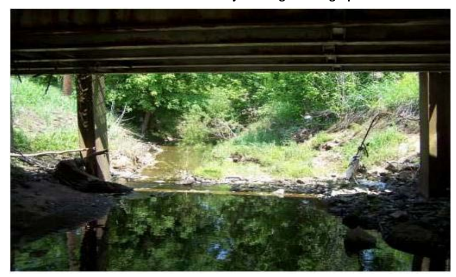
Exhibit 13: KY-1826 Project Bridge looking Downstream