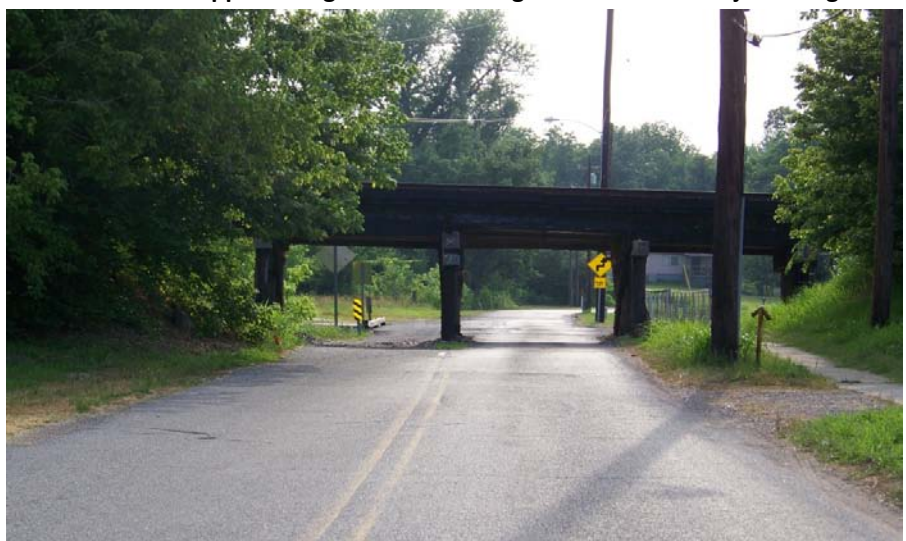
Exhibit 8: KY-1826 continued approach to Railroad Bridge and Project Bridge looking west