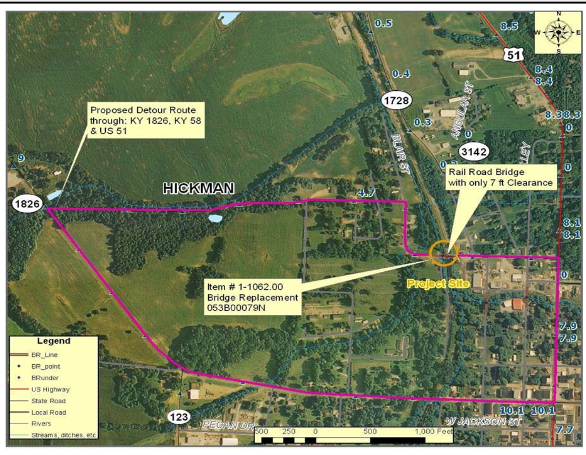
PROJECT SITE & DETOUR 2.3 MILES