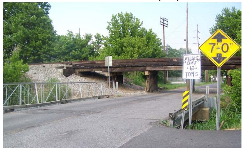
Exhibit 6: KY-1826 approaching Project Bridge looking east